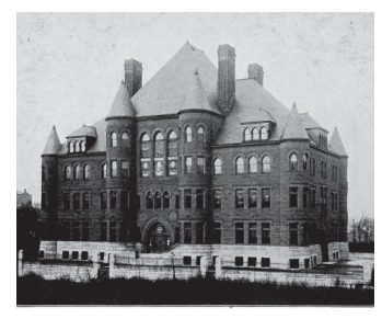
Walnut Hills High School from the 1918 Remembrancer